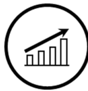
DogData Block Usage